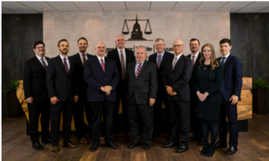
Board-Certified Texas Law Firm

Texas Attorneys with More than 200 Years of Combined Experience Serving Clients throughout the Denton, Tarrant, Collin, and Cooke Counties, our firm delivers effective advice and advocacy in several legal practice areas, including